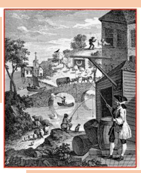
Foreshortening making parts of the picture seem closer than others.