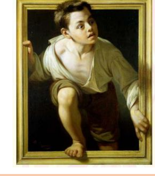
Trompe l'oeil pictures that are created to 'deceive the eye'.

Can I....? ...explain that artists use illusions to create effects? ...understand what perspective is and how this can be? ...use vanishing points and horizon lines in their artwork to create perspective? ...apply perspective in their own artwork? ...explain what foreshortening is? ...explain what photorealism is? ...understand that artists can use perspective to trick the viewer? ...explain what optical art is?